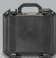
V200 MEDIUM CASE

EXTERIOR DIMENSIONS 15.41" L 13.08" W 6.16" H