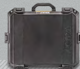
V550 LARGE CASE

EXTERIOR DIMENSIONS 22.42" L 17.46" W 9.16" H