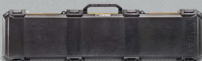
V770 LONG CASE

EXTERIOR DIMENSIONS 51.47" L 13.15" W 6.65" H