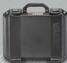
V300 LARGE CASE

EXTERIOR DIMENSIONS 17.54" L 14.21" W 7.16" H