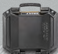
V100 SMALL CASE

Your favorite gear deserves a Vault by Pelican™ case. Our all-new line of hard cases gets you more protection for your money. In toughness and weather resistance, we've given the "off brands" a new challenge. Engineered with an optimized blend of materials and production methods that all add up to unmatched confidence – and value.