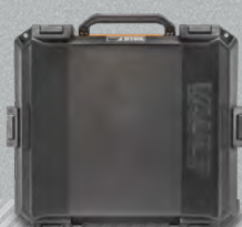
V600 LARGE CASE

EXTERIOR DIMENSIONS 24.55" L 20.59" W 10.16" H