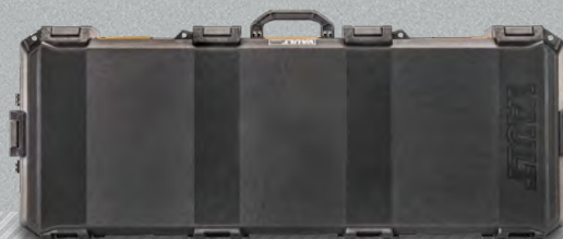
V730 LONG CASE

EXTERIOR DIMENSIONS 47.12" L 19.18" W 6.90" H