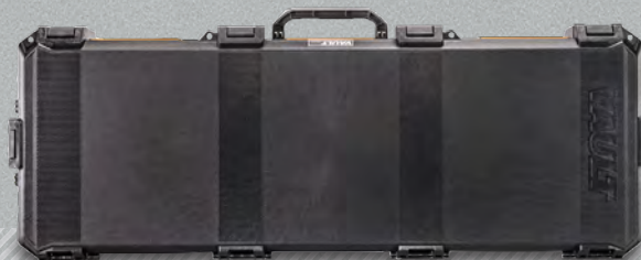
V800 LONG CASE

EXTERIOR DIMENSIONS 56.11" L 19.15" W 6.65" H