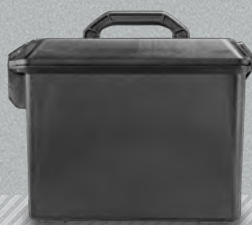
V250 LARGE CASE

EXTERIOR DIMENSIONS 16.27" L 7.90" W 11.93" H