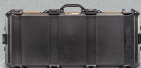
V700 LONG CASE

EXTERIOR DIMENSIONS 39.61" L 17.65" W 6.65" H