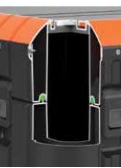
DOUBLE WALL DESIGN FOR UBER-STRENGTH

The world is a rough place, especially for luggage. And after 35 years of building Pelican protector cases we've seen it firsthand. Which is why Pelican ProGear™ Elite luggage uses double wall construction to withstand extreme loads- up to 1,500 lbs. Now you can travel with confidence (and fragile items). This luggage has also survived free-fall impact tests with up to 25 pounds of weight.