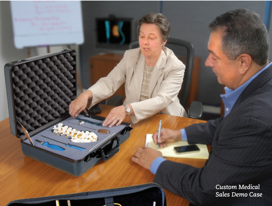
Custom Medical Sales Demo Case

Experience and innovation makes Platt the leader – since 1921 – in the custom case industry. Our product development team and experienced engineering staff have the knowledge to create a custom solution to fit your unique requirements. Leverage the expertise of our engineers to develop a solution for your branding, shipping, protection and organization needs.