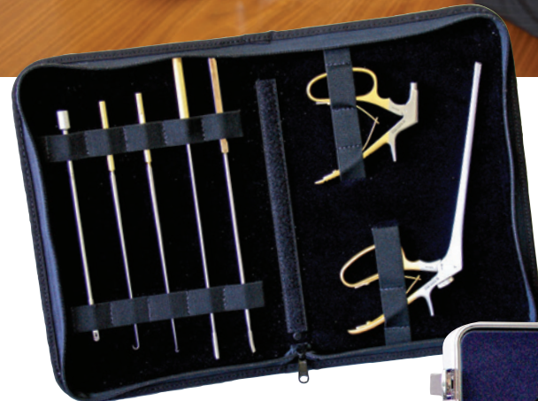
Custom Sewn Case