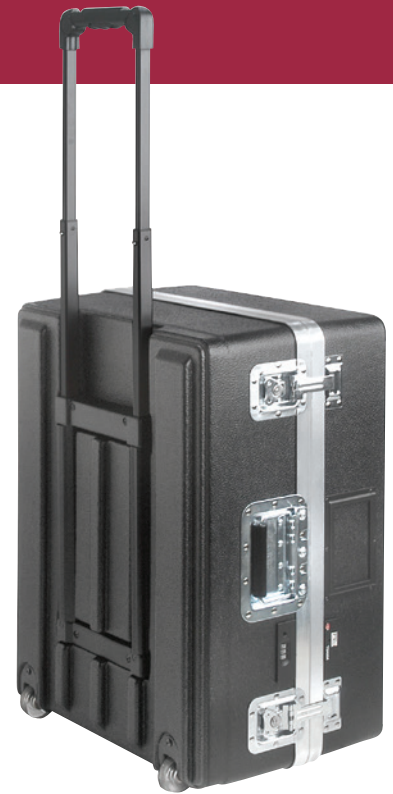
2007 Medium-Duty Case