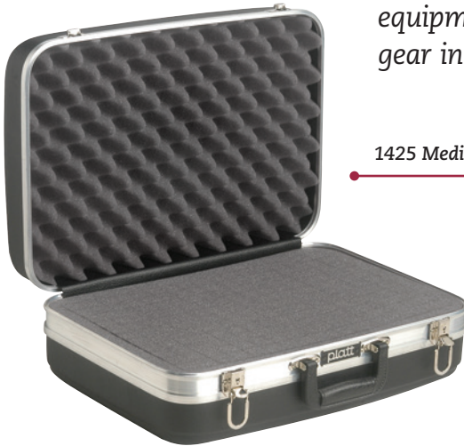
1425 Medium-Duty Case

Foam-filled cases for any type and size of equipment. Securely carry and protect your gear in cases built for tough environments!