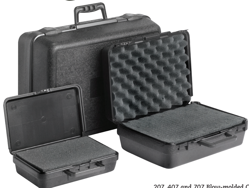
207, 407 and 707 Blow-molded Cases