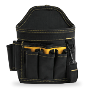
8-POCKET TOOL POUCH WITH TAPE HOLDER